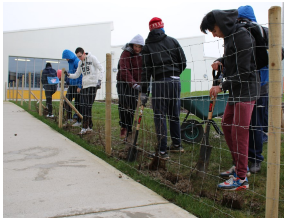
6th year Leaving Cert Applied students planting shrubs in the school grounds as part of their community work project.