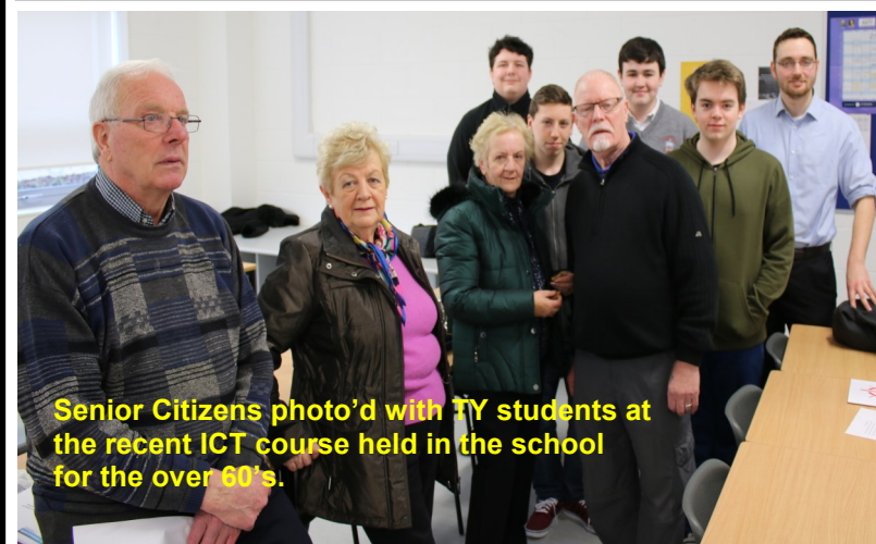
Senior Citizens photo'd with TY students at the recent ICT course held in the school for the over 60's.

Our next competition will be the O' Brien Cup in April. We wish our team ever success.