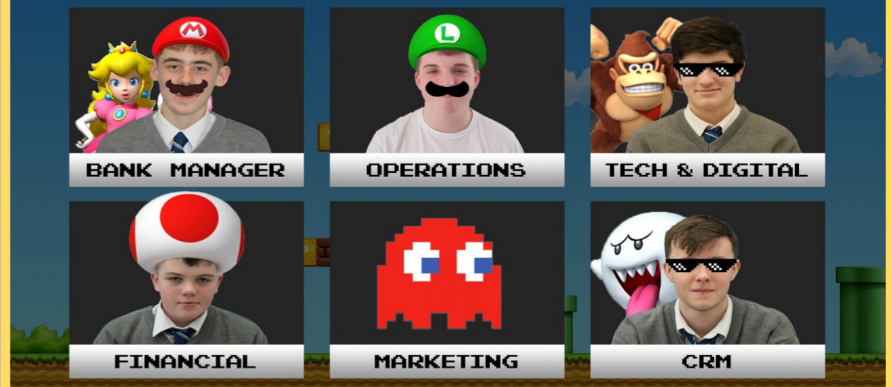
The AIB Build-A-Bank Team 2020