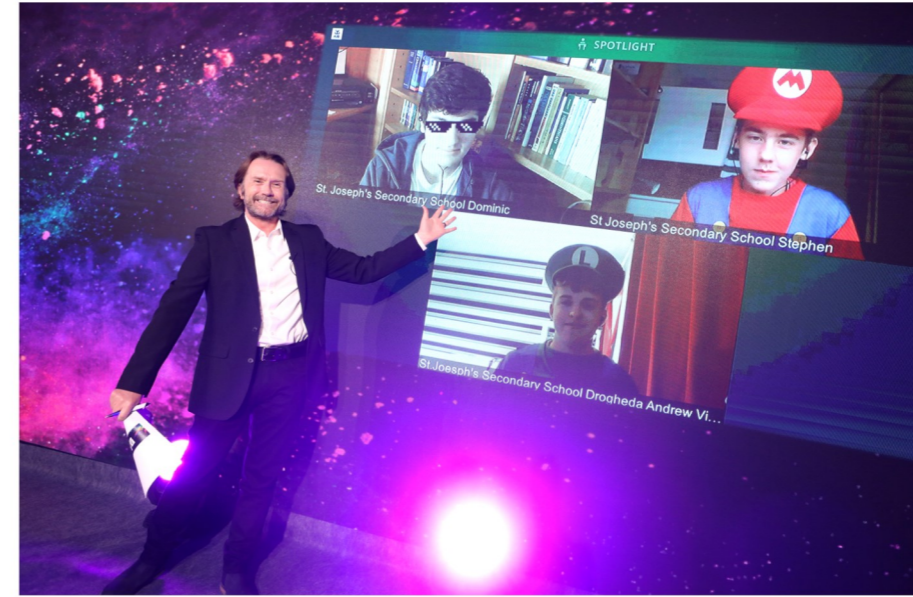
The TY Build-A-Bank team on their conference call during the competition

Due to Covid-19, The AIB Build a Bank Competition in the RDS was cancelled for this year. However, AIB decided not to let all our hard work go to waste. They adapted to hold the competition online over conference calls.