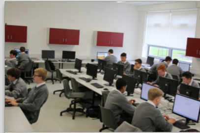
TY3 working on their Microsoft Word skills.

All students in the school now have access to a school email account and teachers are being encouraged to use Google Classroom, an online platform where class notes and useful materials can be shared.